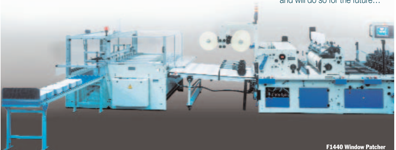
F1440 Window Patcher

“ Several new revolutionary projects are in development and represent a significant opportunity and future challenge for a medium-sized company that repeatedly attracts attention due to its innovations. Our creativity knows no boundaries — this is what has secured our success and will do so for the future...”